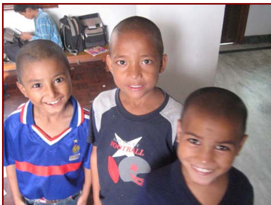
All the rescued children have made a full recovery after being rushed to the hospital's malnutrition ward.

But these were tough kids, and after a few scary days, they were out of the hospital and on the mend. They were fed, given proper clothes, and slept in a safe place for the first time in almost a year, thanks to the Umbrella Foundation. They even went to school for the first time in their lives. And at long last, their smiles finally emerged!