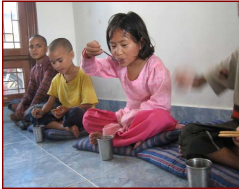
The five rescued children being properly fed for the first time in months thanks to NGN and the Umbrella Foundation.