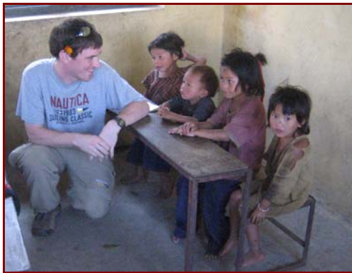
NGN is helping the Umbrella Foundation develop their Gurje Village Project – the pilot project is aimed at getting destitute school children the education they deserve.

The project is beginning with a pilot project, already underway, to improve the local school to ensure the eighty children attending get the education they deserve, warm clothes, and a proper daily meal.