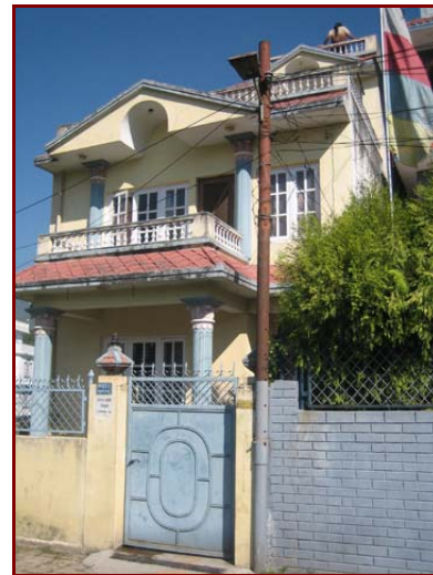
The proposed site for our new children's home

These abandoned children must be rescued. With the six children mentioned earlier, we have seen how precarious life can be for them. The only way to properly care for them is to open our own home.